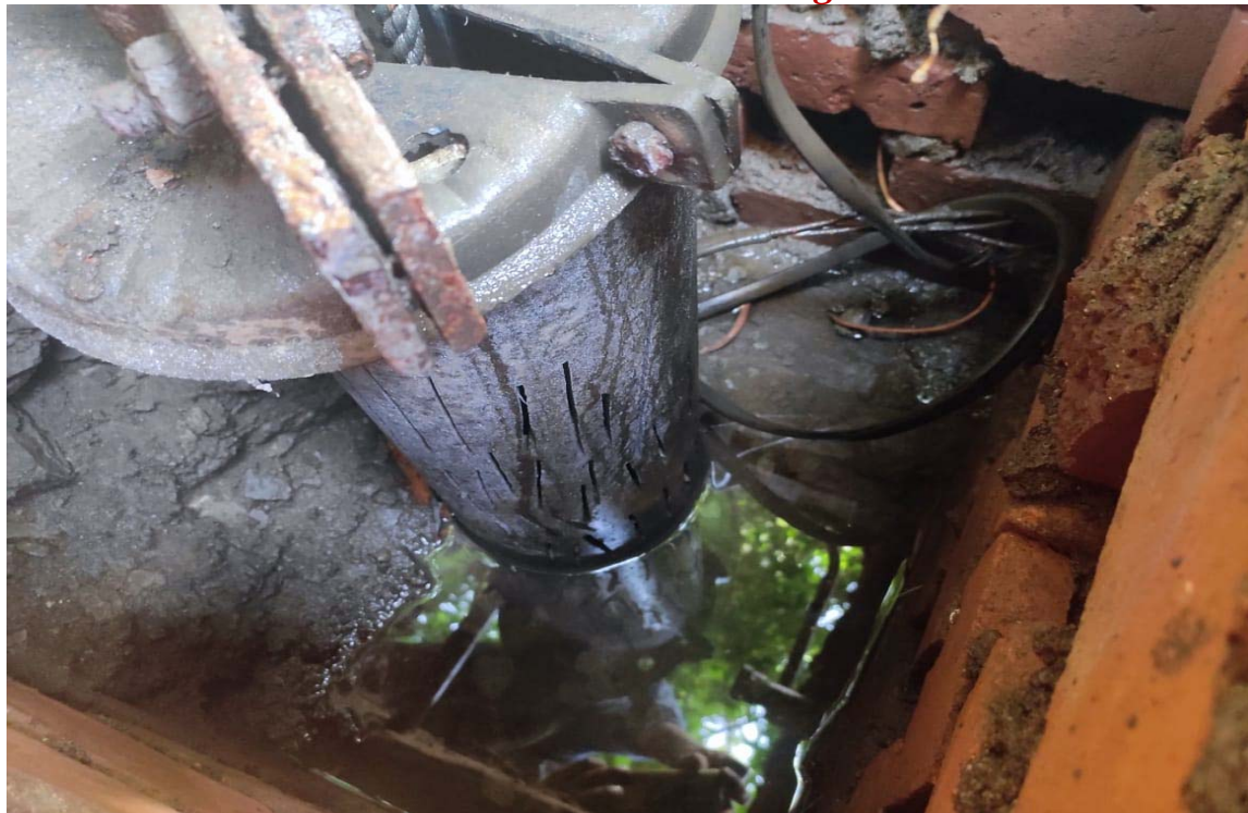
Bore well Recharge with Rain Water